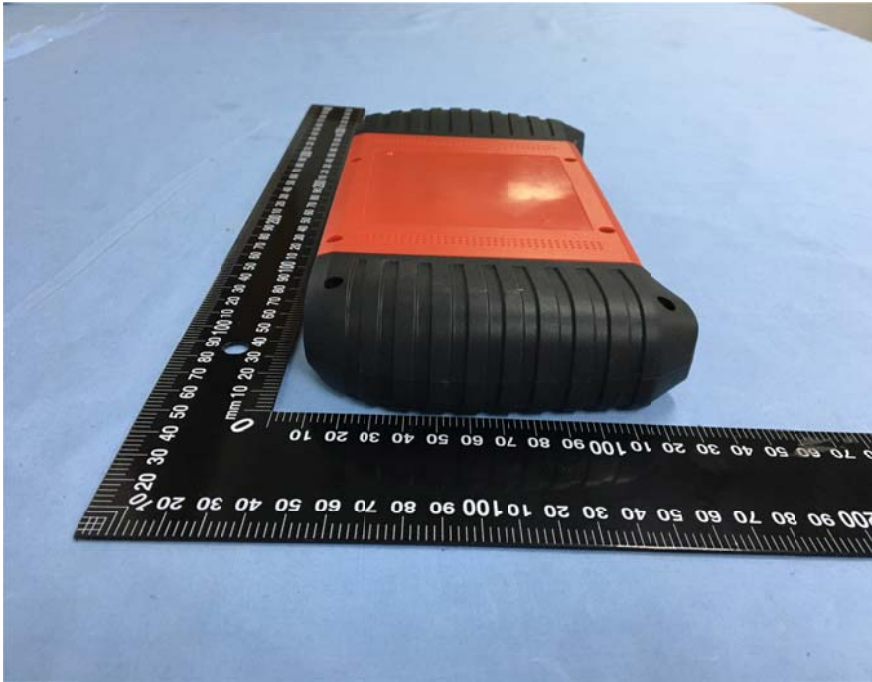
EUT View (5)