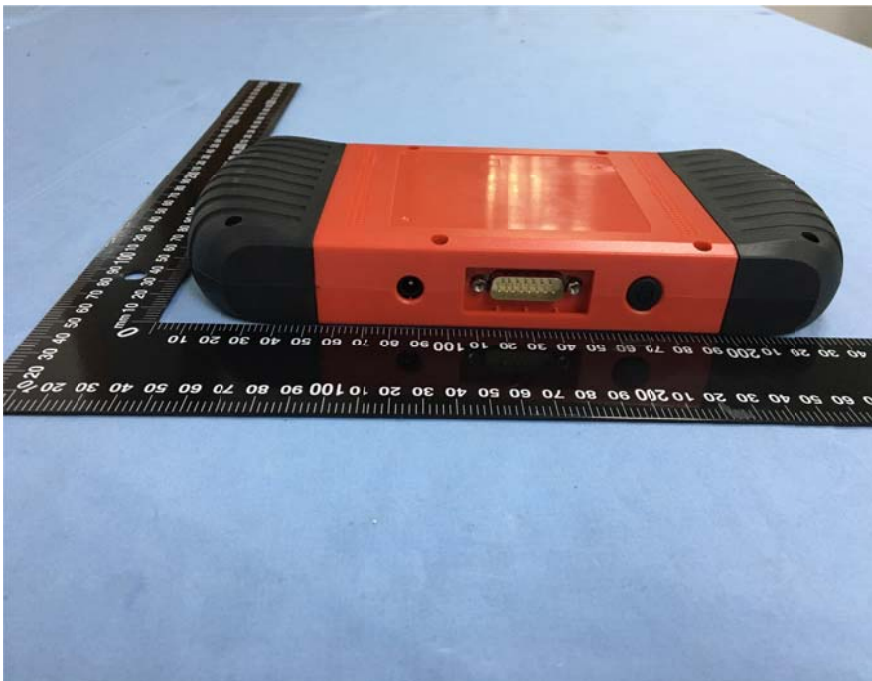
EUT View (6)