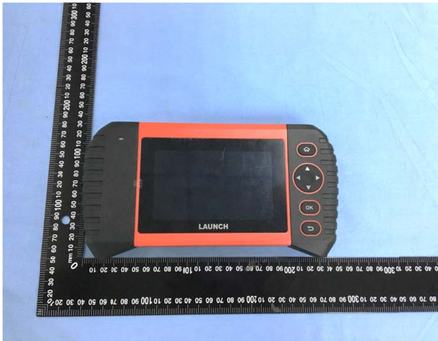
EUT View (2)