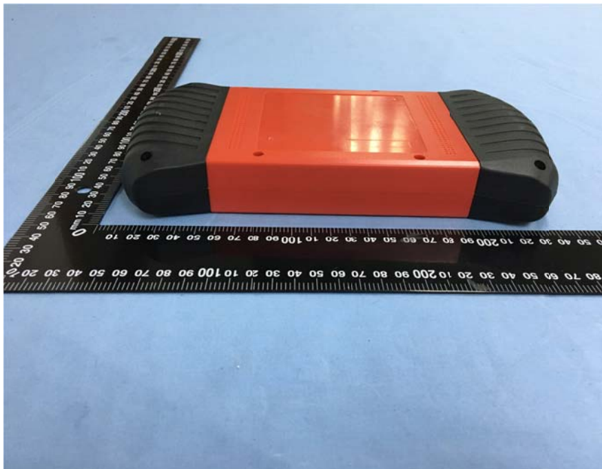
EUT View (4)