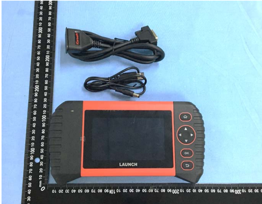
EUT View (1)