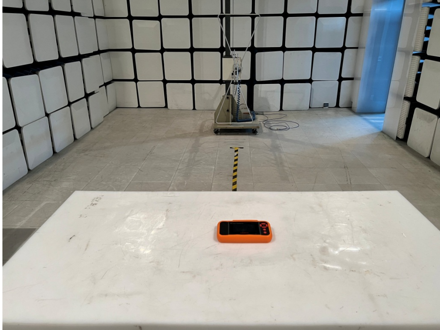
30MHz - 1GHz