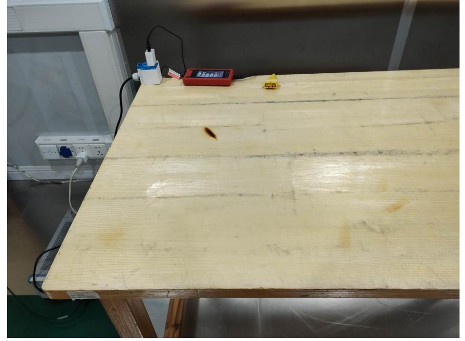
1.2 Photograph – Radiated Emissions