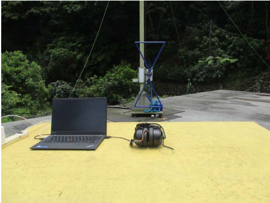
Below 1 GHz (EUT at 0.8m)