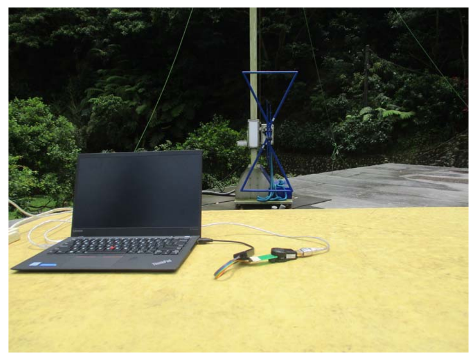
Below 1 GHz (EUT at 0.8m)