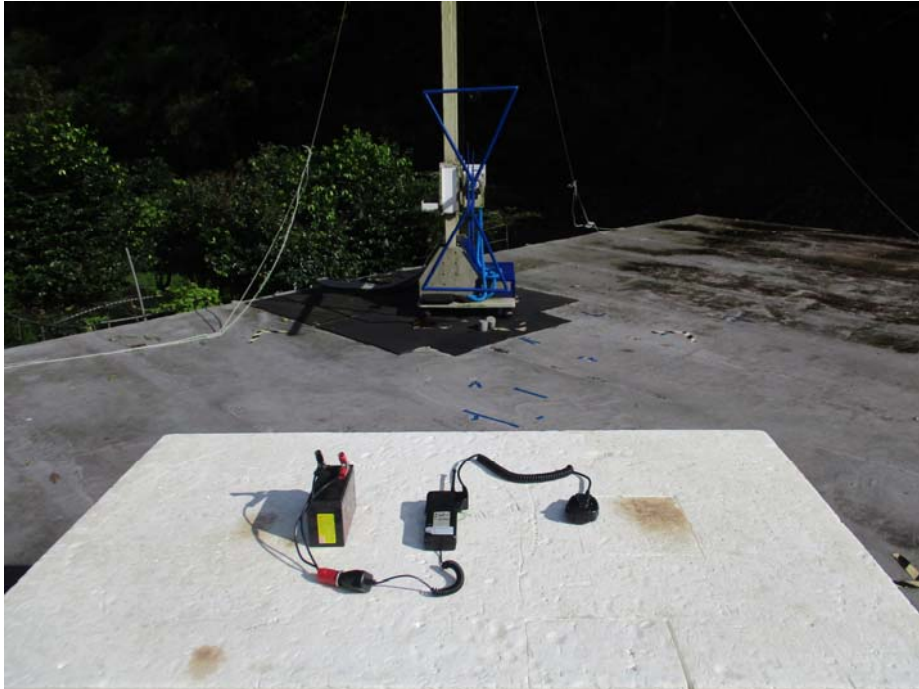
Below 1 GHz (EUT at 0.8m)