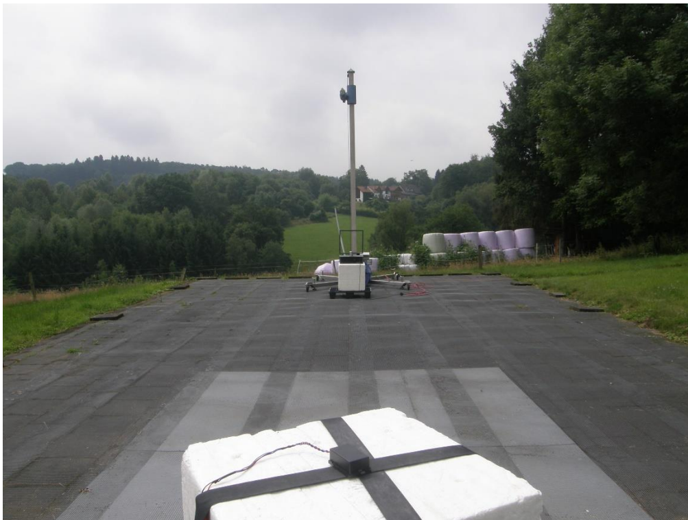
Photo to the test: Restricted bands of operation / Radiated emission limits – 9 kHz – 30 MHz