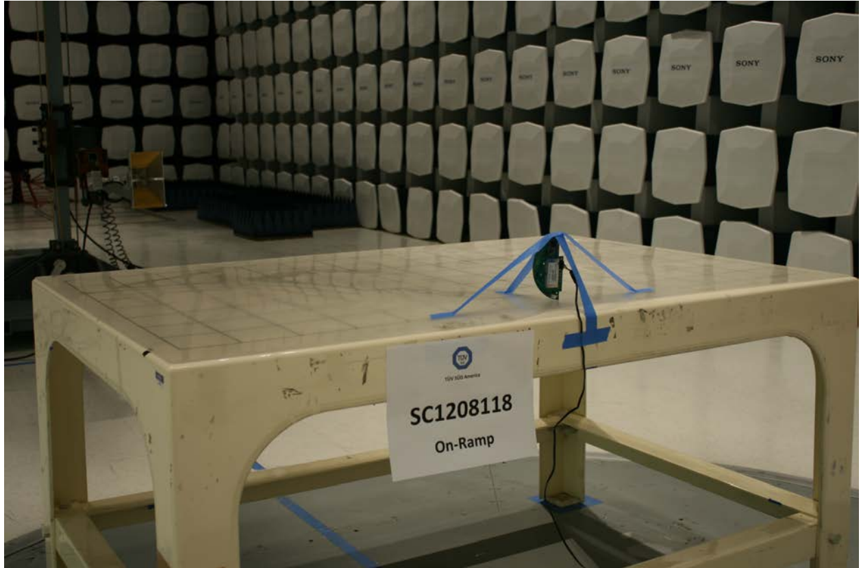
Radiated Emissions Test Setup