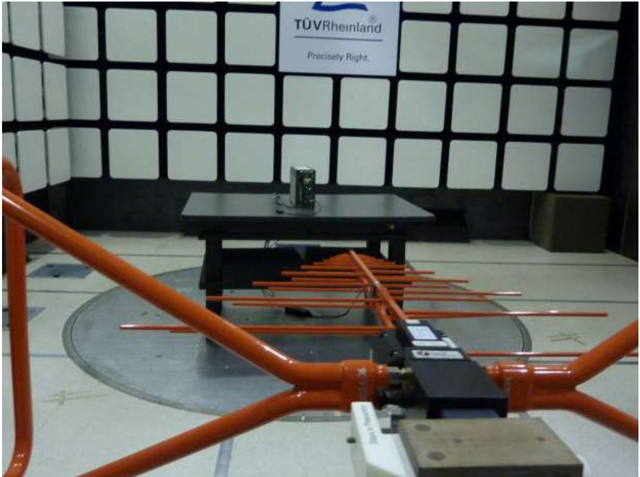
Radiated Emissions Front side

PTC-3000 RF Radio Module was tested inside the 4MCU Chassis