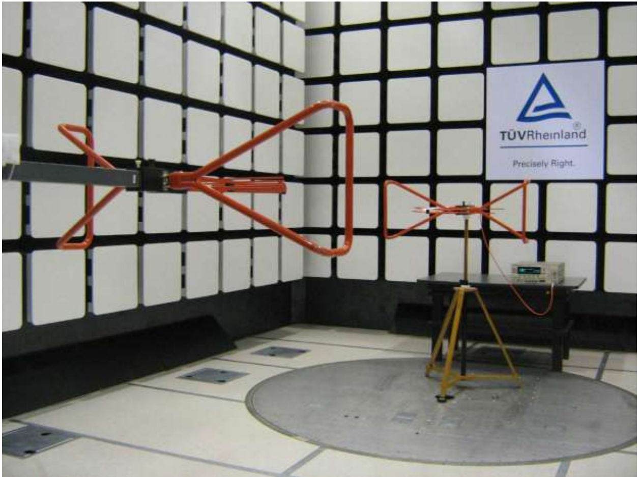
Photo of Test Setup for 30 MHz to 1000 MHz Substitution