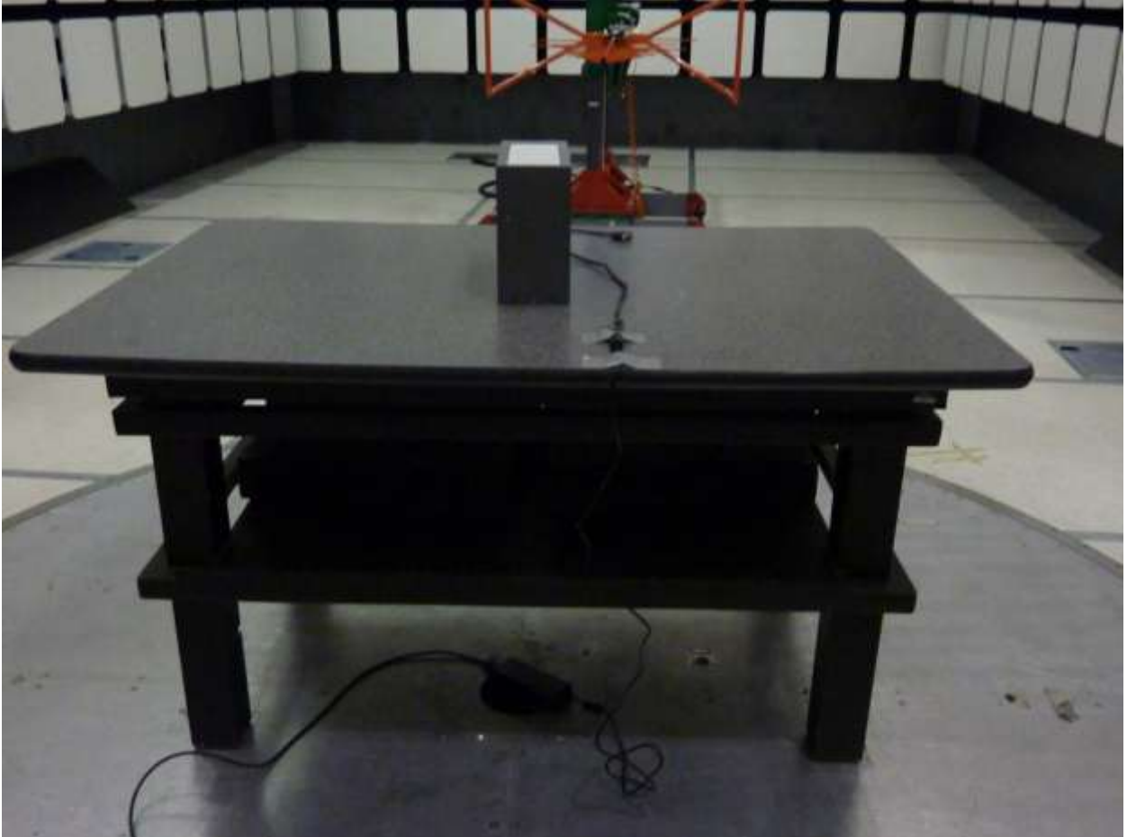
Test Setup – Radiated Emissions