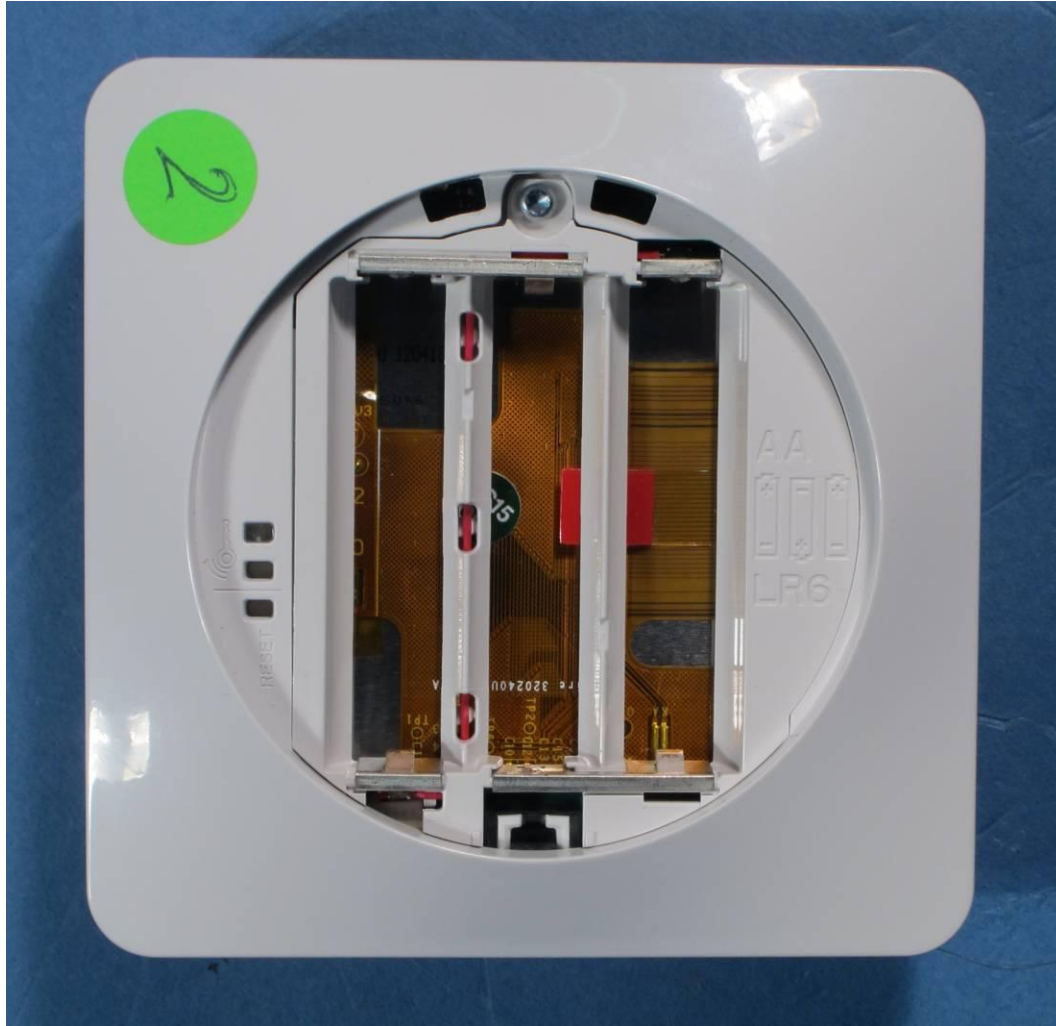
Photograph 1: - Velux 3LR A02 US, internal view 1