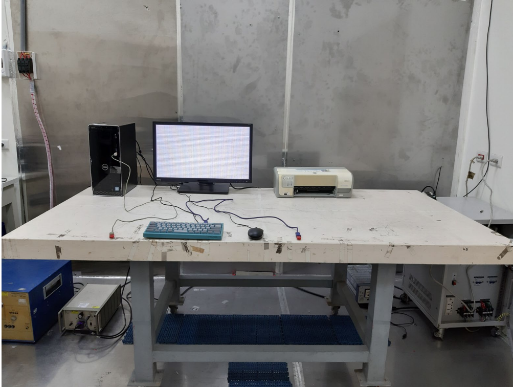
Photograph – Conducted Emission Test Setup