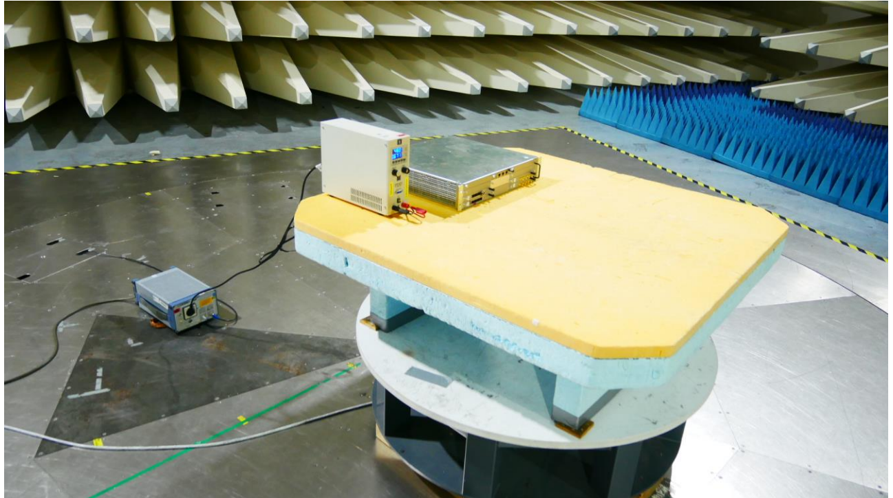
Test setup for AC powerline conducted emissions