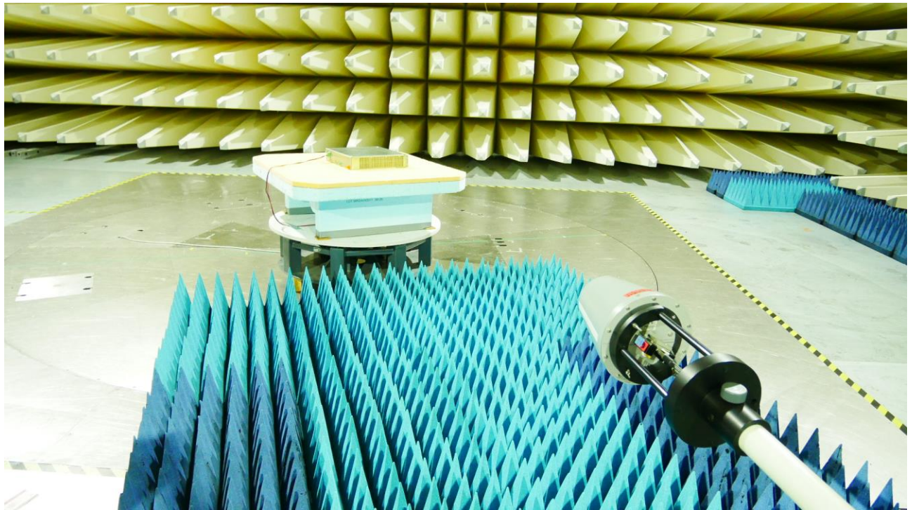
Test setup for radiated emissions in the frequency range 1 – 6 GHz