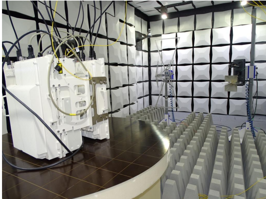
Photo 3: Test setup for radiated emissions measurements in fully-anechoic chamber with ancillary equipment on the table (1 GHz to 27 GHz), rear side view