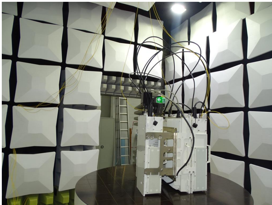
Photo 4: Test setup for radiated emissions measurements in fully-anechoic chamber with ancillary equipment on the table (1 GHz to 27 GHz), left side view, detailed