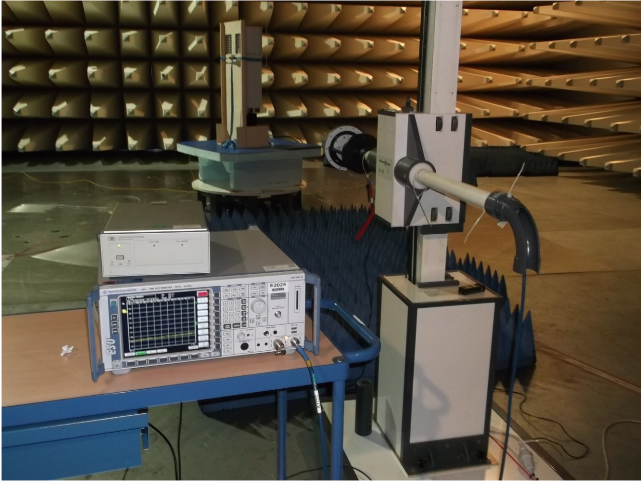
picture 2: Test setup: Field Strength Emission >1 GHz @3m in the SAC