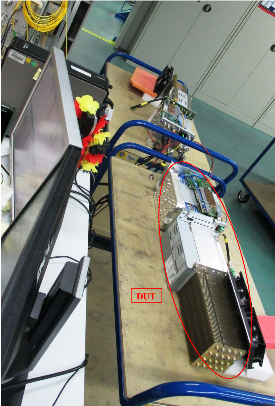
Auxiliary ION-U H 7P/80-85P/17P/19P & DUT ION-U EU H 7P/80-85P/17P/19P FCC ID: XS5-UH781719P FCC ID: XS5-UEUH781719P