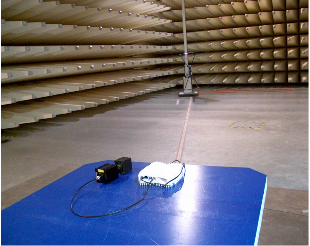
picture 8.2: Test setup: Field Strength Emission <1 GHz @10m in the SAC