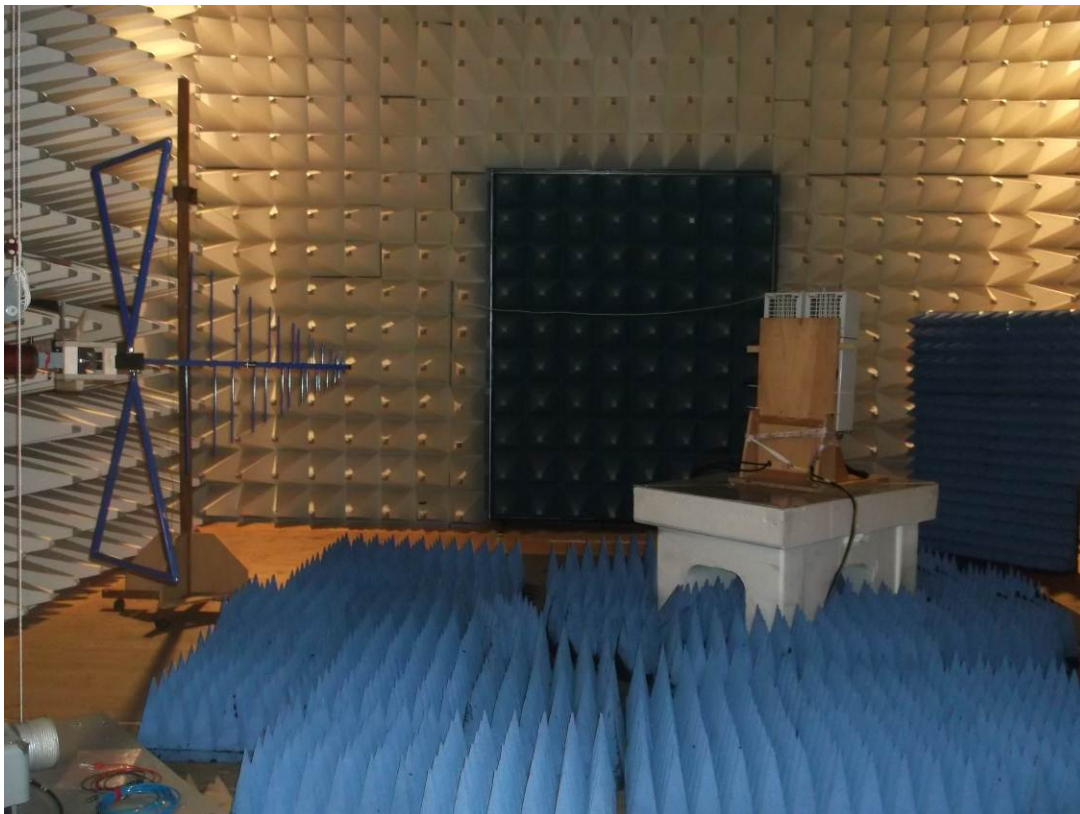
picture 8.2: Test setup: Field Strength Emission <1 GHz @3m in the FAC