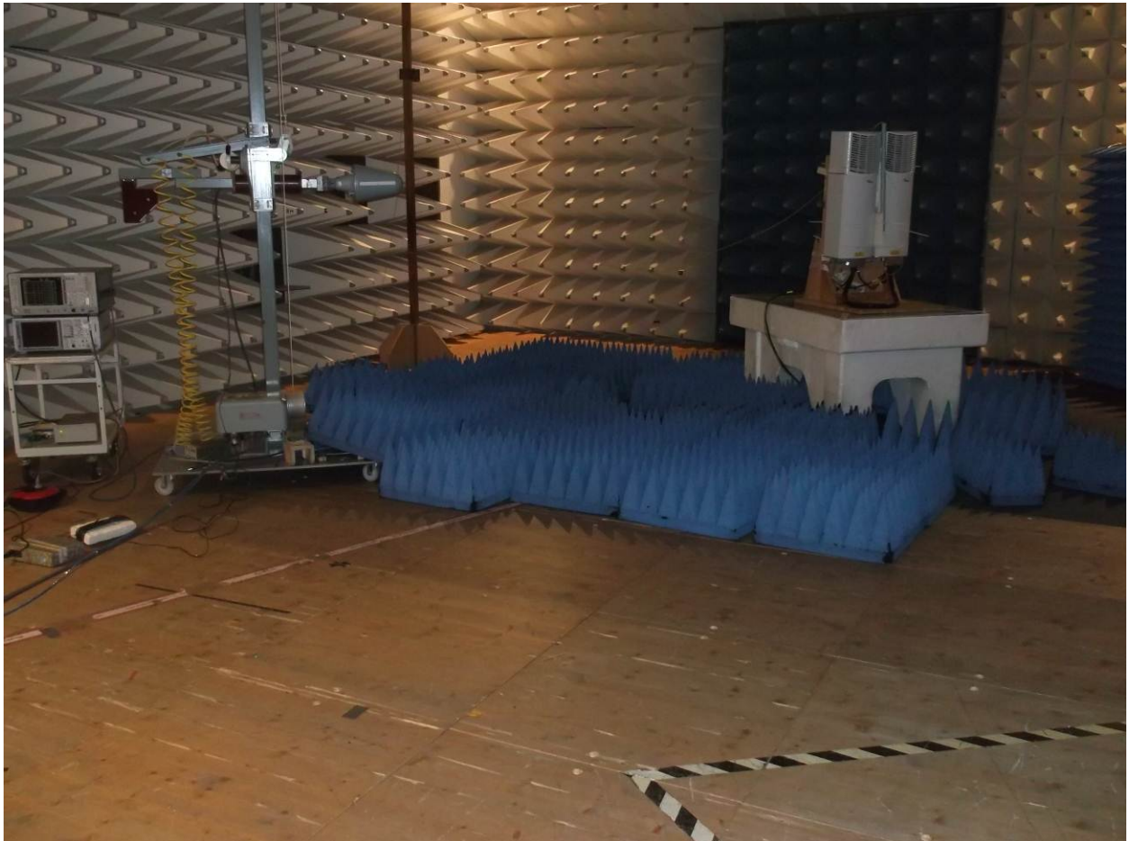
picture 8.3: Test setup: Field Strength Emission >1 GHz @3m in the FAC