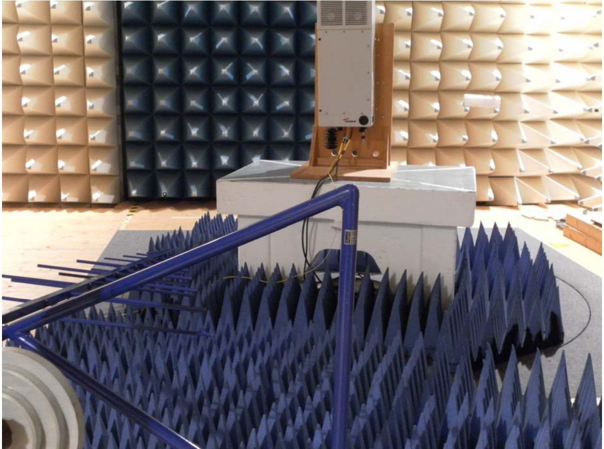
Radiated emission < 1GHz