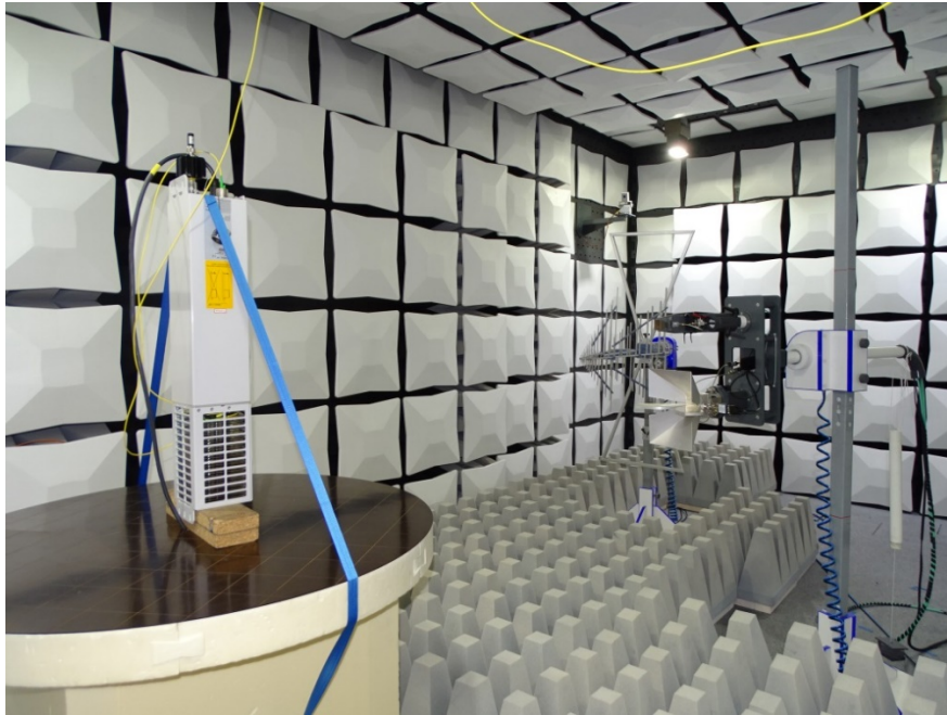
Photo 3: Test setup for radiated emissions measurements in fully-anechoic chamber (1 GHz to 26 GHz), rear side view, EUT vertical