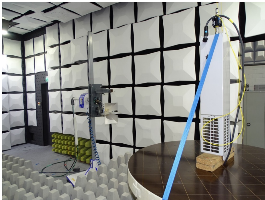
Photo 4: Test setup for radiated emissions measurements in fully-anechoic chamber (1 GHz to 26 GHz), right side view (termination of RF connectors)