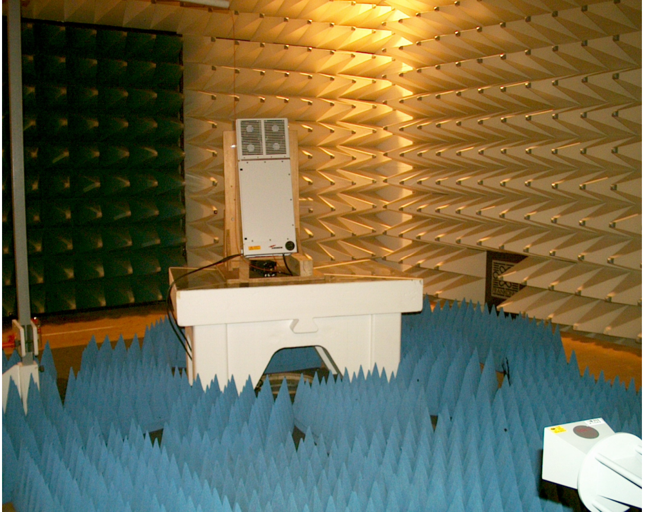
picture 3: Test setup: Field Strength Emission >20 GHz @3m in the FAC with Absorber material