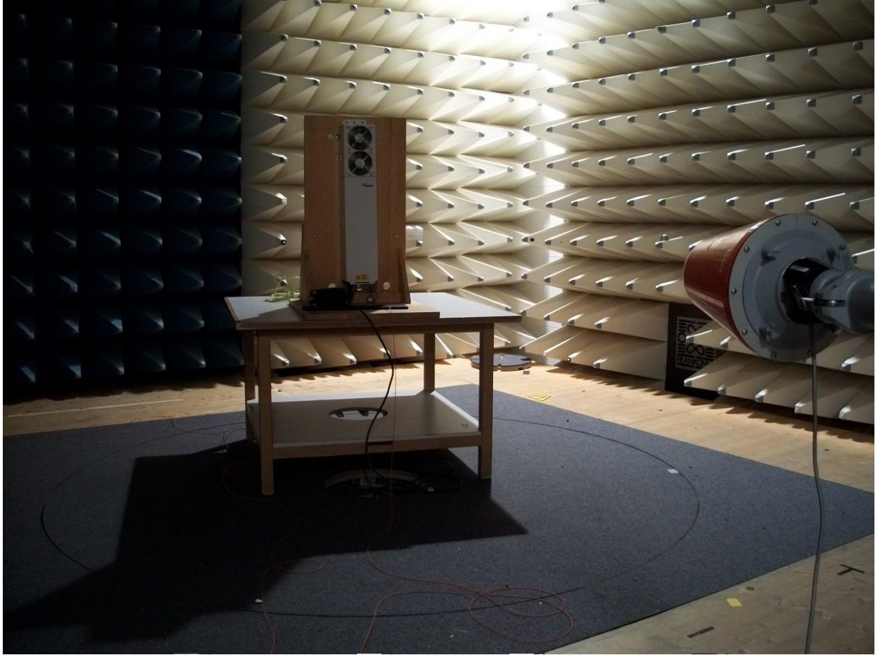
set-up >1GHz radiated @3m FAC