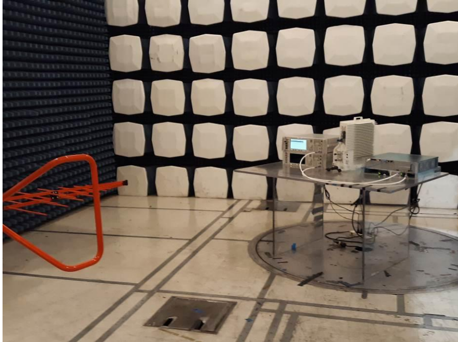
Photograph 1. Radiated Spurious Emissions, Test Setup (Below 1GHz)