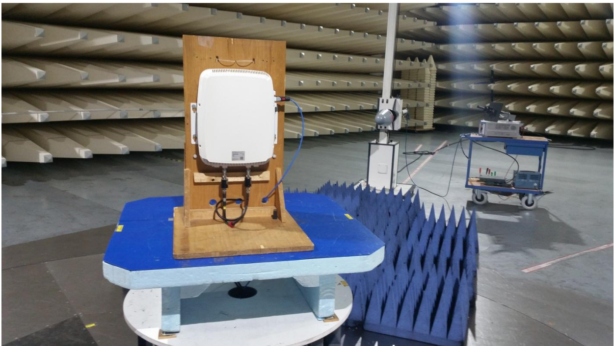
Test setup: Field Strength Emission 1 - 18 GHz @3m in the SAC