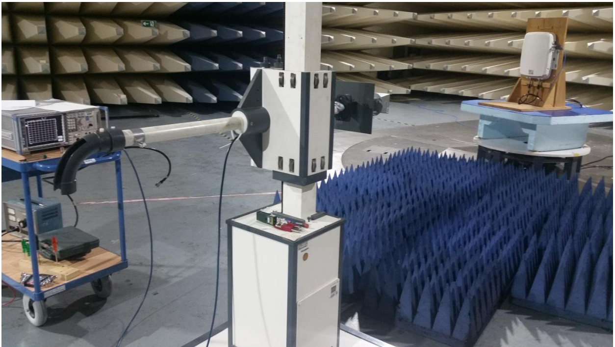
Test setup: Field Strength Emission 18 – 26,5 GHz @3m in the SAC