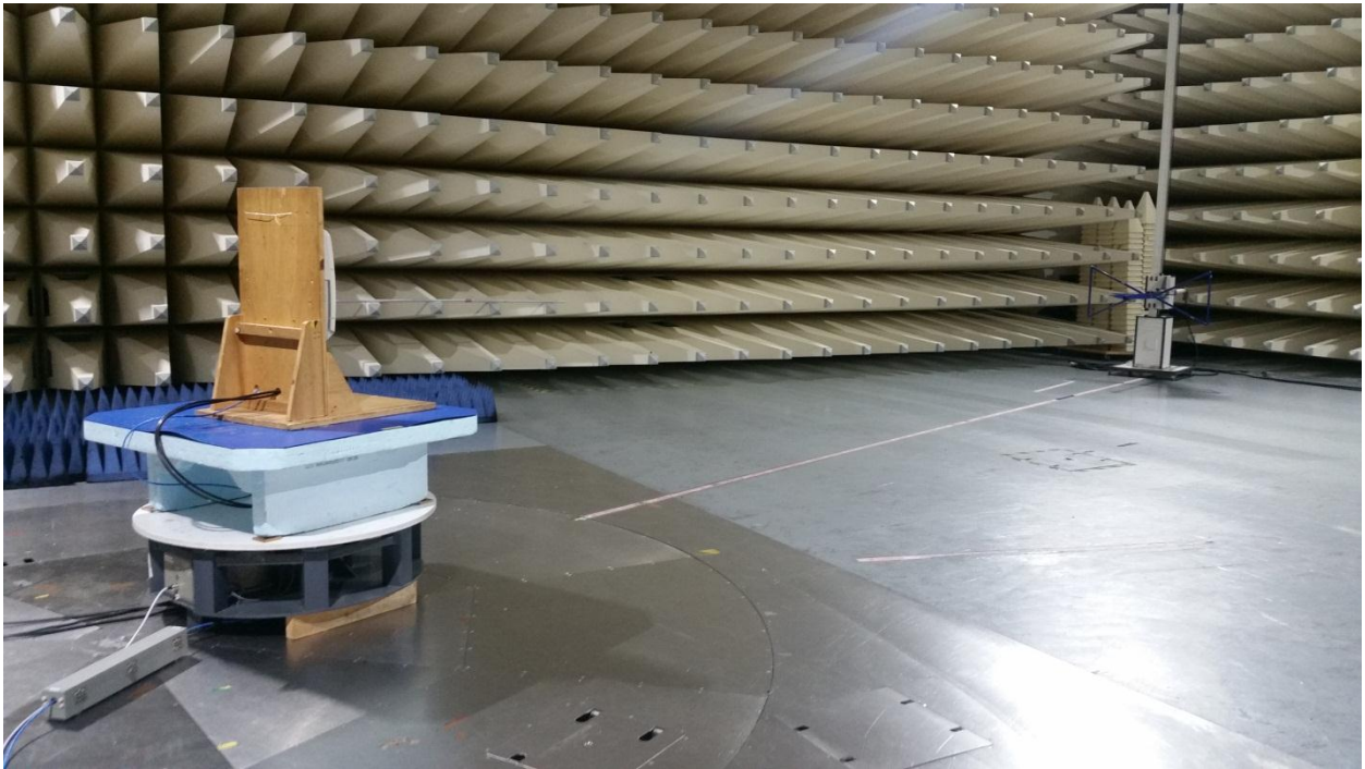
Test setup: Field Strength Emission <math>< 1\text{ GHz}</math> @10m in the SAC