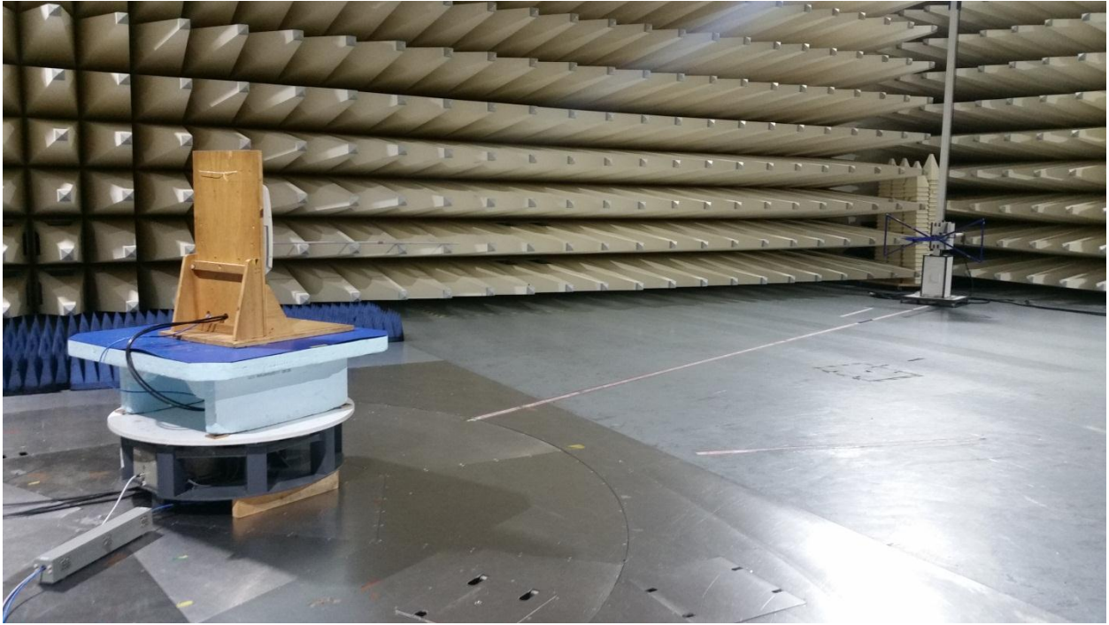
Test setup: Field Strength Emission <math>< 1\text{ GHz}</math> @10m in the SAC