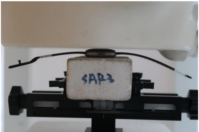
Back at 0 mm