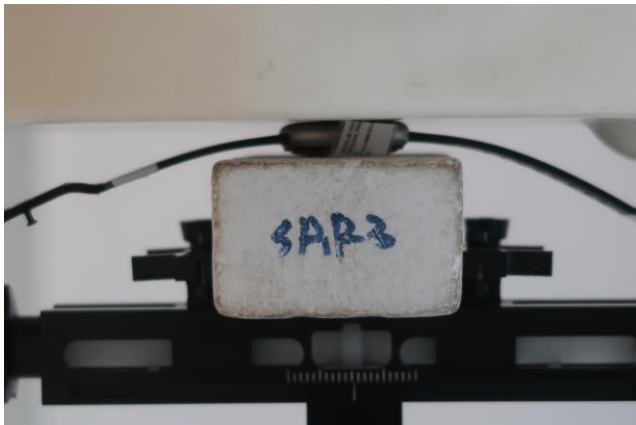
Front at 0 mm