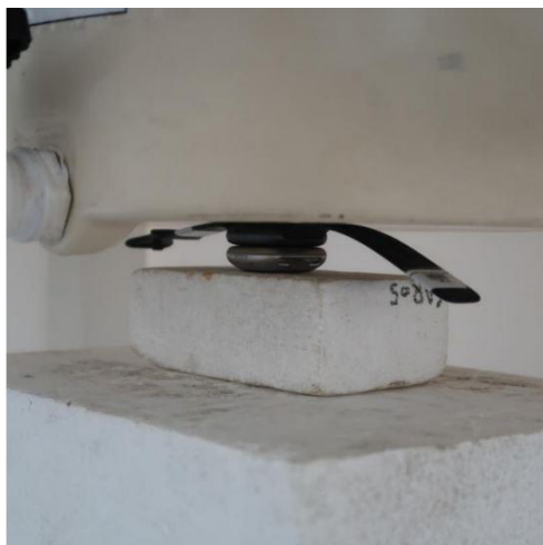
Back with NFC transmission at 0 mm