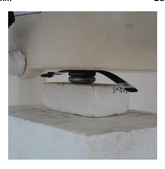
Back with NFC transmission at 0 mm

TEL: 886-3-327-3456 Page: D1 of D2 FAX: 886-3-328-4978 Issued Date: May 25, 2022