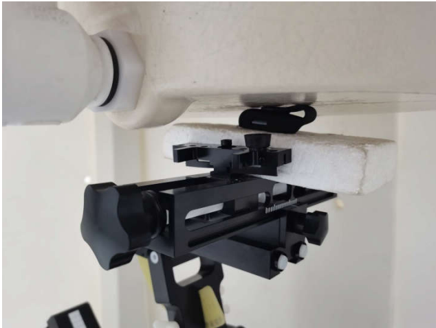
Back_Clip-Ant Right, Test Separation 0 mm