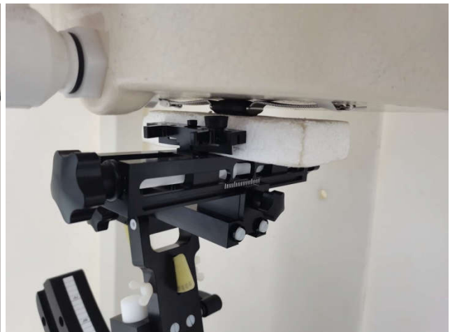
Back_Metal Strap, Test Separation 0 mm