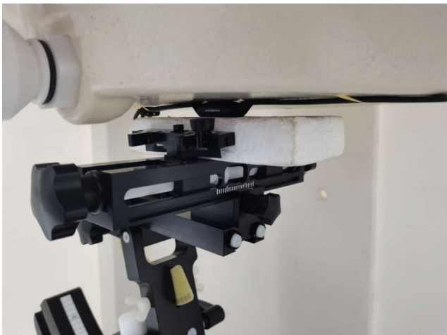
Back_Rubber Band, Test Separation 0 mm