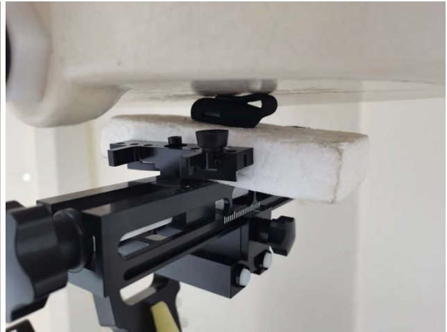
Back_Clip-Ant Left, Test Separation 0 mm