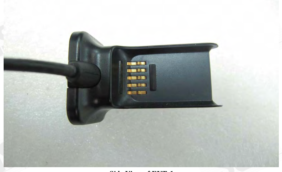
Side View of EUT-1