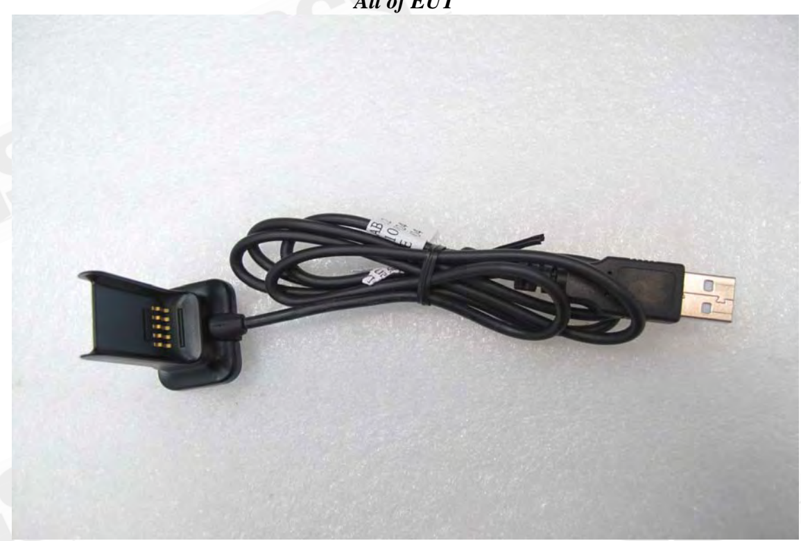
Front of EUT