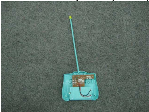
Front View of the product (Internal)