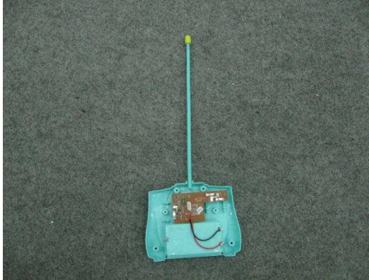
Front View of the product (Internal)