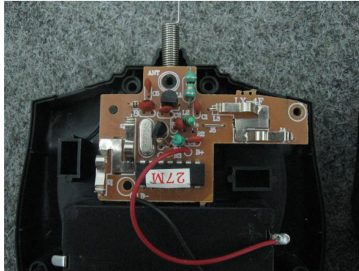
Inner Circuit Bottom View