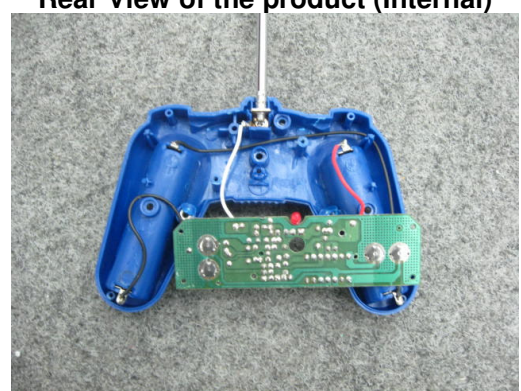
Rear View of the product (Internal)