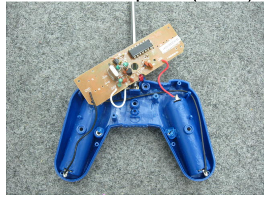
Front View of the product (Internal)