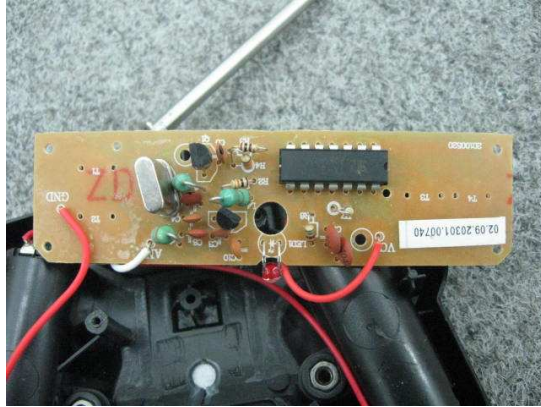
Inner Circuit Bottom View