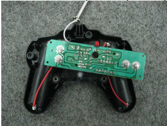
Front View of the product (Internal)