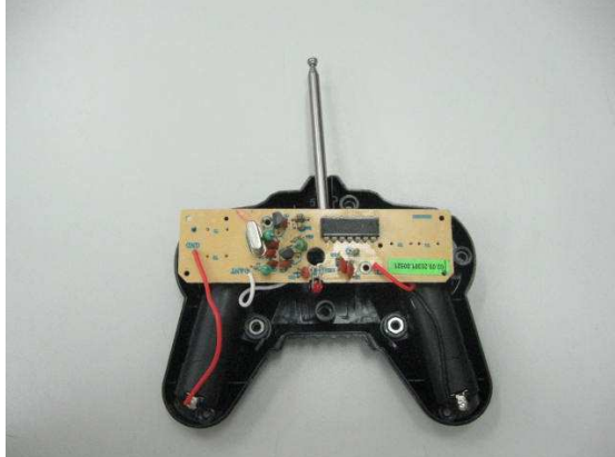
Rear View of the product (Internal)