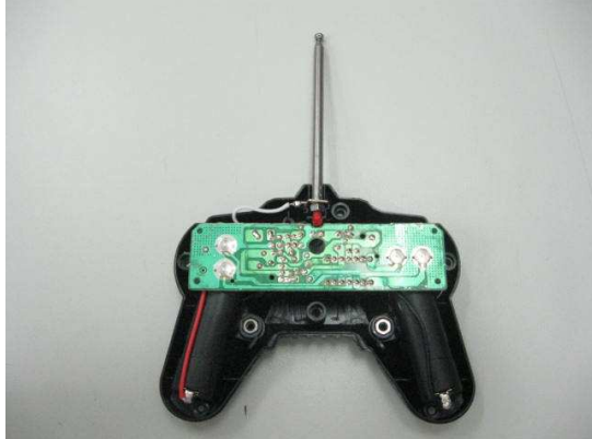
Front View of the product (Internal)