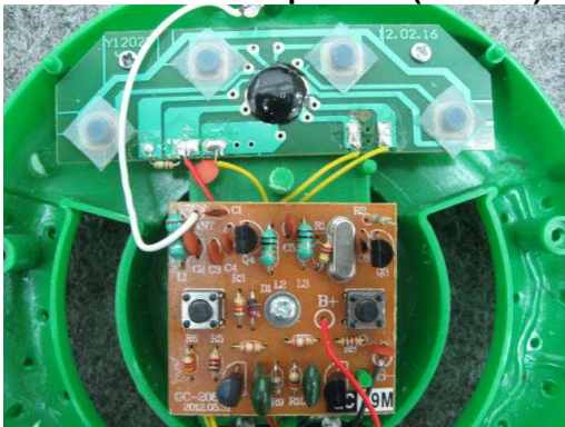
Front View of the product (Internal)