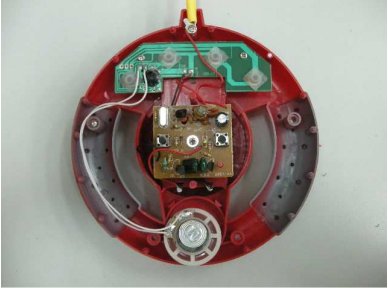
Rear View of the product (Internal)