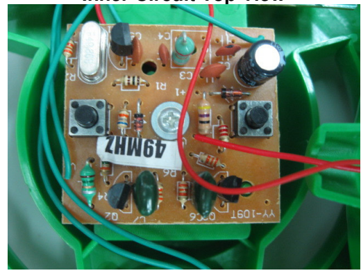
Inner Circuit Top View