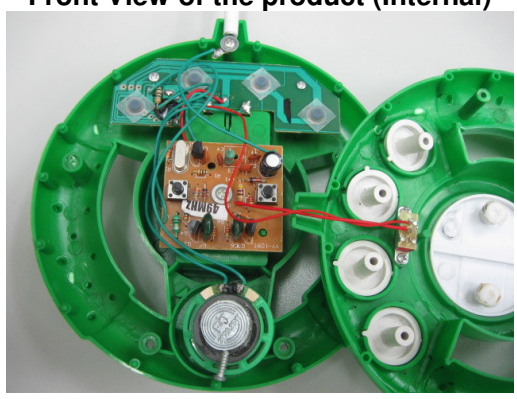
Front View of the product (Internal)