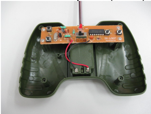
Front View of the product (Internal)