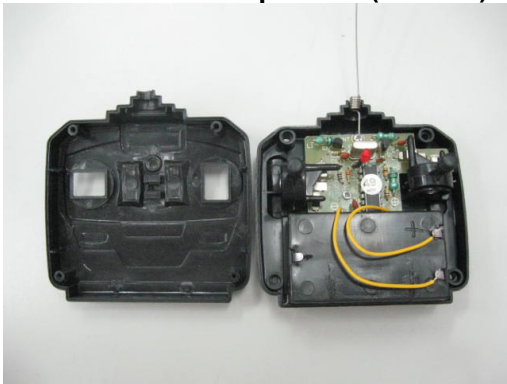
Front View of the product (Internal)