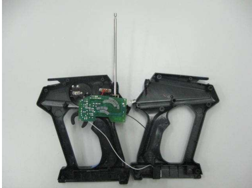
Front View of the product (Internal)