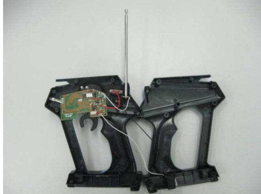
Rear View of the product (Internal)