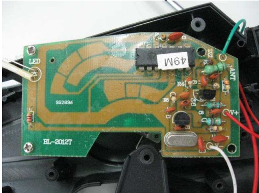
Inner Circuit Top View