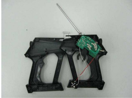
Rear View of the product (Internal)