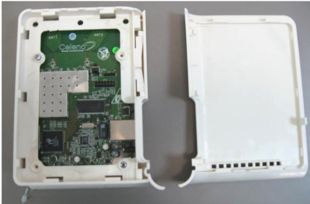
Photograph No.1 Clienttransceiver internal view