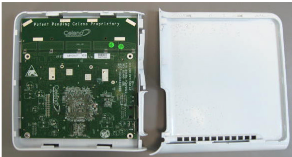
Photograph No.1 Access point transceiver internal view