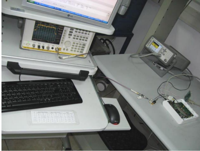
Photograph No.1 Peak power spectral density, occupied bandwidth measurement setup