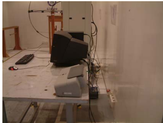
Side view of Conducted measurement

Copyright of this report is owned by Centre of Testing Service and may not be reproduced other than in full except with the written approval of the issuing Company.