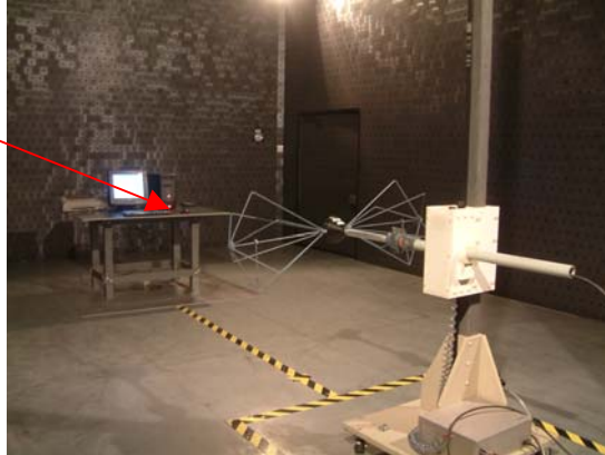
Low frequency of Radiated measurement