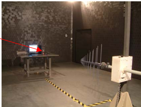
High frequency of Radiated measurement