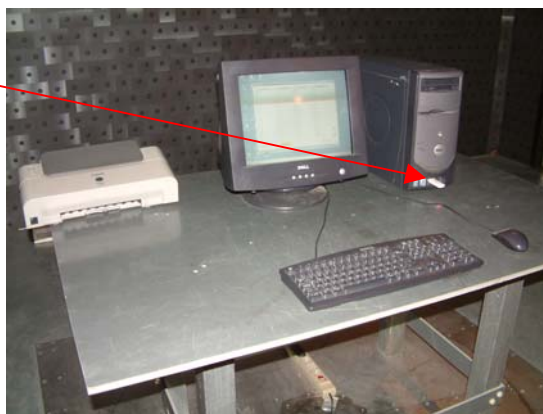
Position of EUT Cricking

opyright of this report is owned by Centre of Testing Service and may not be reproduced other than in full except with the written approval of the issuing Company.