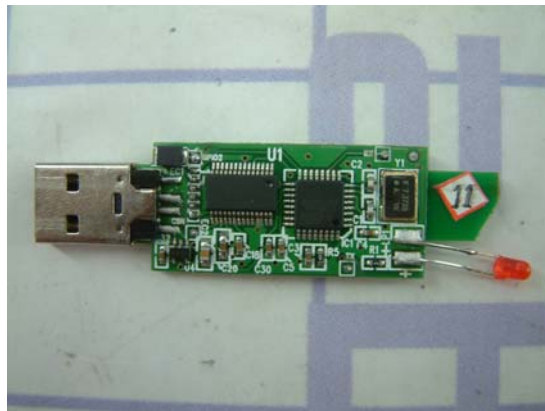
PCB 1 layout