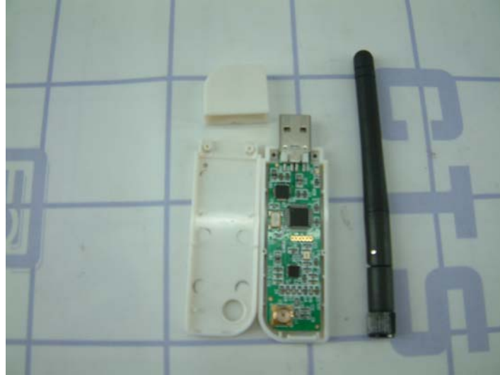
Figure 4 PCB layout