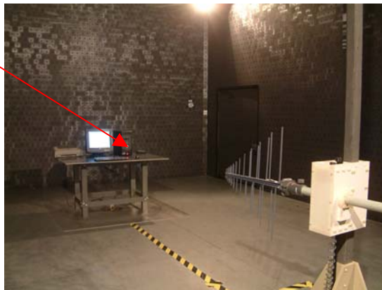
Low frequency of Radiated measurement