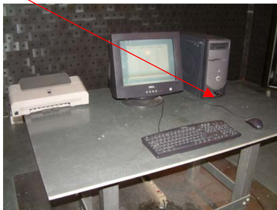
Position of EUT Circling

copyright of this report is owned by Centre of Testing Service and may not be reproduced other than in full except with the written approval of the issuing Company.