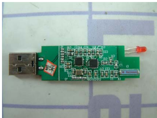
PCB 1 Solder

Copyright of this report is owned by Centre of Testing Service and may not be reproduced other than in full except with the written approval of the issuing Company.