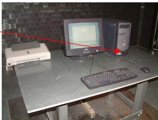
Position of EUT Circling

Copyright of this report is owned by Centre of Testing Service and may not be reproduced other than in full except with the written approval of the issuing Company.