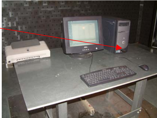
Position of EUT Circling