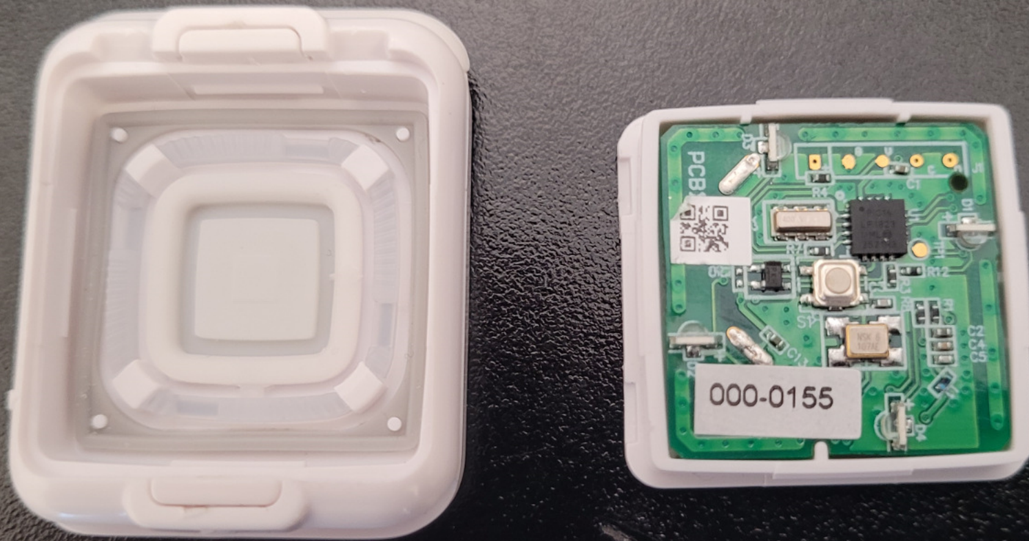
Inside View #1 of the EUT