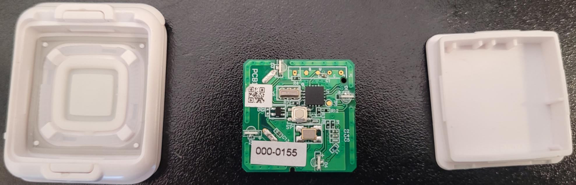
Inside View #2 of the EUT