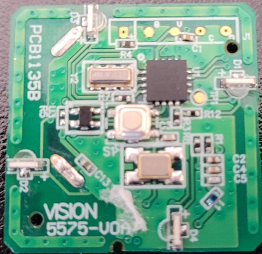
Bottom View of the PCB with Labels Removed - View #2